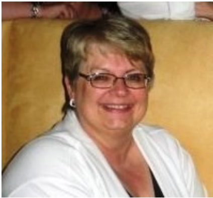
Our distinguished speaker

How tall are the stacks of your genealogical materials and in how many rooms are your papers and books stored? Is it time you made sense of your materials, organized them so they can be found, and determined what is important to keep handy? How should you store your important materials? Just starting your research? Why not organize sensibly from the beginning? Too far past the beginning? This session will help you deal with these questions, and also provide easy tips to help keep you on top of your organization. Whether you use electronic, paper, or a combination of methods, consistency is the clue. Specific examples will help the understanding of how common sense organizing actually can be. We'll even discuss some "lazy day" methods to keep you on top of your filing.